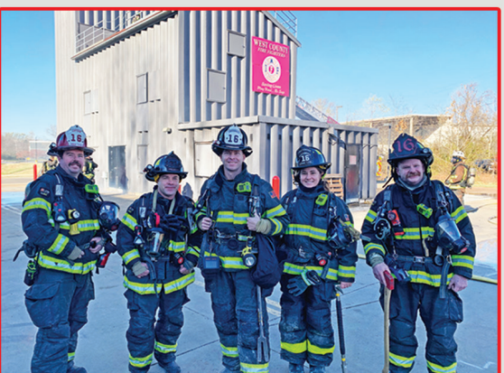
Lemay B-shift fire training