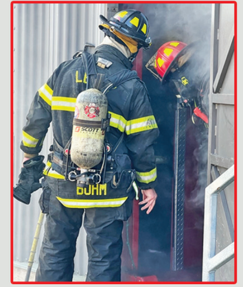
Live burn training