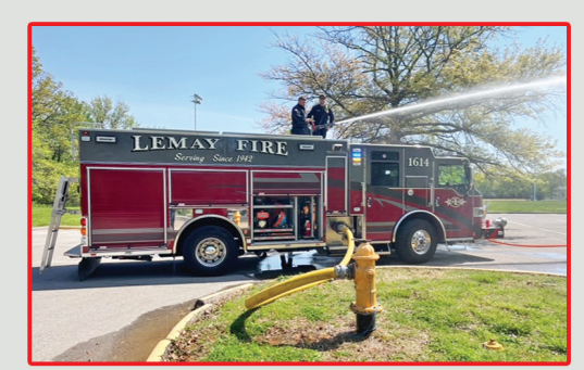
Water supply and master stream training