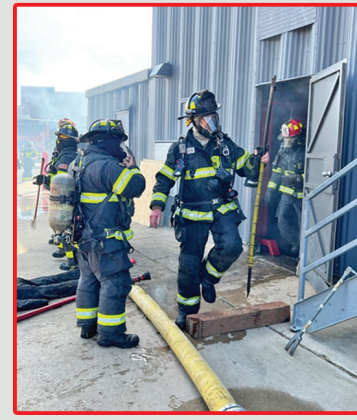
Search and rescue training