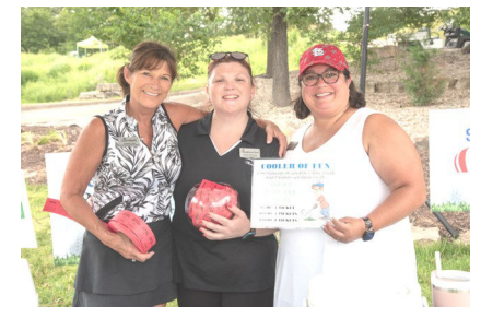
Delmar Gardens/Garden Villas South