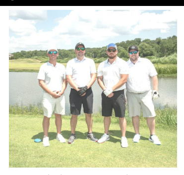
Flight A—First Place Reinhold Electric