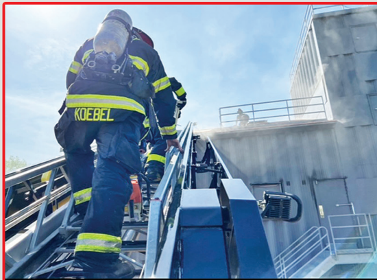
Roof ventilation training