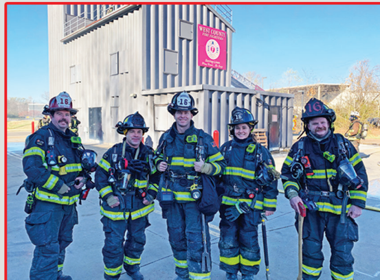
Lemay B-shift fire training