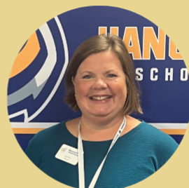
Tara Hill HS/MS-Spanish