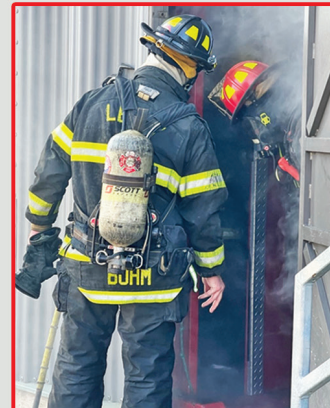
Live burn training