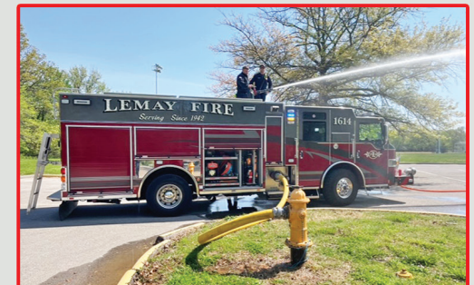
Water supply and master stream training