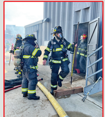
Search and rescue training